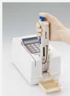
Step 3: Apply sample and reference solution to E-Plate. Results in one minute.