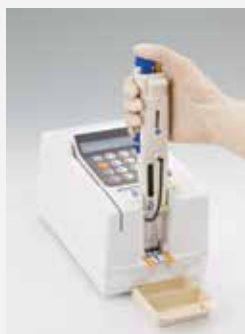
Step 1: Set the exclusive E-Plate on the analyser