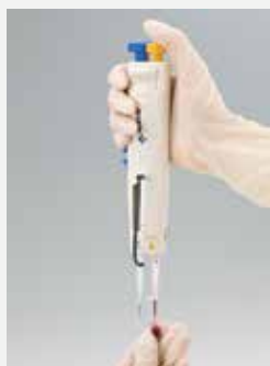
Step 2: Draw the sample and reference solution